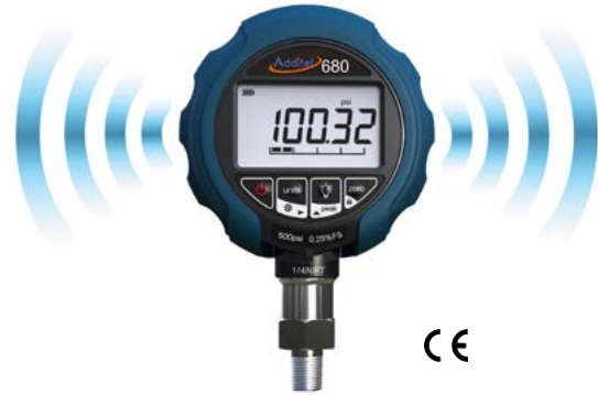
680 with data logging and wireless (optional)