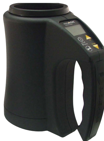
A6145537 / A6145553